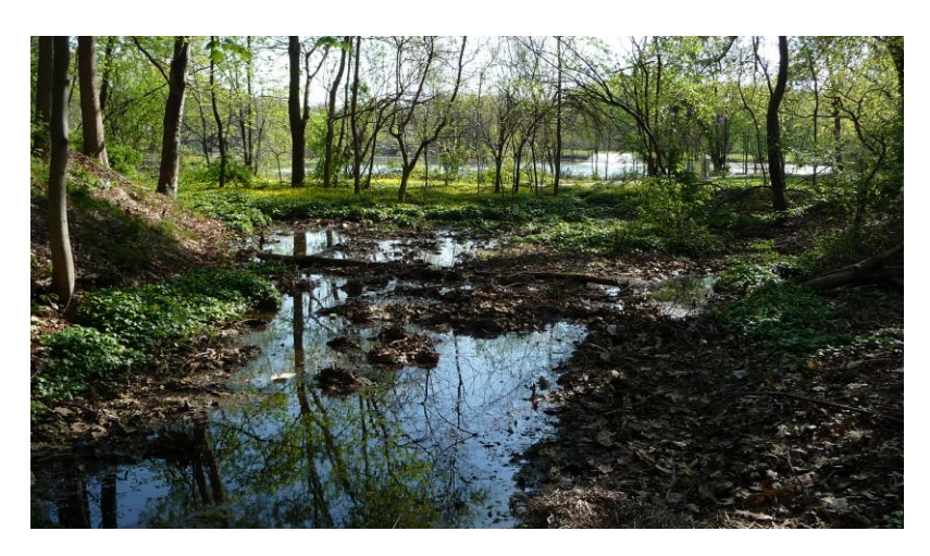
The creek and wetland, looking towards Newton Lake

"This project will serve as a living example of the right way to manage stormwater runoff and restore a stream corridor" says Maya K. van Rossum, the Delaware Riverkeeper and head of the Delaware Riverkeeper Network. "The runoff is treated as a resource, guided through an improved native landscape to help water the plants, and captured by the rain gardens where it is further cleaned and infiltrated into the soil below. This infiltration helps feed the creek with a clean and steady supply of groundwater."