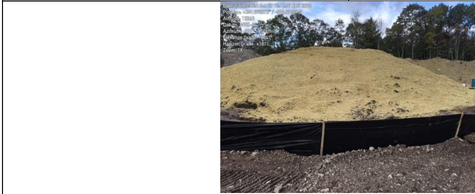
Photograph 7: Area G (Highland) winter stabilization soil stockpile.