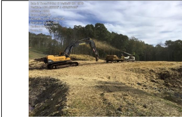
Photograph 5: Winter stabilizing at Area F (Highland).

For the Period of October 11 through October 24, 2018