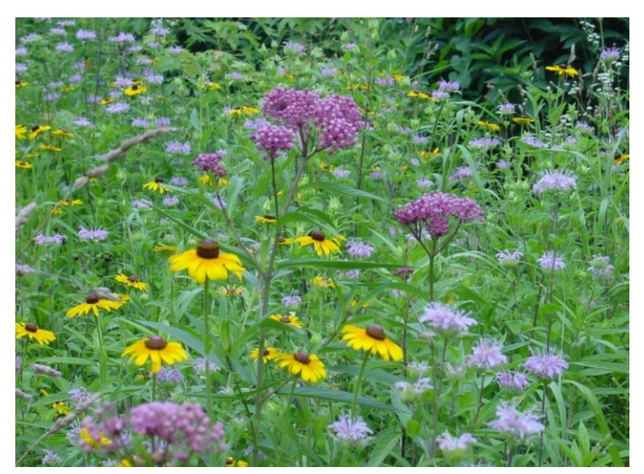
NATIVE RIPARIAN PLANTS, GRASSES, AND TREES HELP TO RESTORE DAMAGED STREAMS STRENGTHENING THE BANKS AND CREATING ROOT SYSTEMS.

Restoring our floodplains by creating forested buffers along our rivers and streams protects communities from the expected increase in flooding that will accompany changing weather patterns and increased rise of sea level that will result from global climate change. At the same time it provides the quality of vegetation that can be part of the solution for reducing the advance of global climate change by sequestering carbon and filtering air pollution.