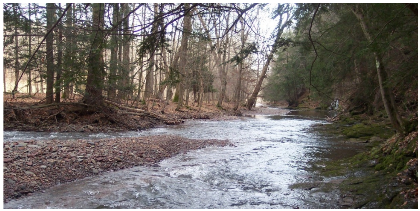
TINICUM, PA DRN RECEIVED FUNDING TO DEVELOP RESTORATION AND MANAGEMENT PLANS FOR 2 MILES OF TINICUM AND RAPP CREEK. THE PLANS WILL ADDRESS INCREASES IN STORMWATER RUNOFF, FLOODING, STREAM BANK EROSION AND THE LOSS OF RIPARIAN BUFFERS. TREES AND WOODY SHRUBS NATURALLY PROVIDE FLOOD FLOW REDUCTION.

A loss of tree cover over a 15 year period (1985 to 2000) in Bucks, Montgomery, Delaware, and Chester Counties, Pennsylvania and Mercer, Burlington, Camden and Gloucester Counties, New Jersey, reduced the ability of the Delaware watershed region's urban forests to "detain almost 53 million cubic feet of stormwater, a service valued at $105 million."<sup>26</sup> Despite that diminishment, this same region "stored 2.9 billion cubic feet of stormwater in 2000, valued at $5.9 billion."<sup>27</sup>