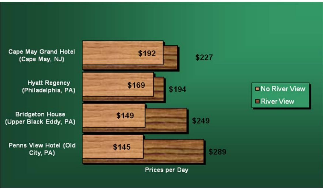
Figure 1: Hotel Room Prices With and Without a River View

Figure 1 shows a range of hotels along the Delaware River that offer both views of the riverfront and rooms without views of the riverfront. The range between the two demonstrates that people are willing to pay more for a view of the River. At the Cape May Grand Hotel located near the mouth of the Delaware Bay, a room with a waterfront view costs $227 per night, while a view on the opposite side of the same hotel costs only $192 for the same night.<sup>58</sup> The Hyatt Regency in Philadelphia also increases the price on rooms with a view, charging $247 for a king size bedroom without a River view as compared to $282 for a king size bedroom on the waterfront.<sup>59</sup> Up river at the Bridgeton House in Upper Black Eddy, prices can be found for nearly $100 more with a Delaware River view.<sup>60</sup> And the historic Penn's View hotel in Philadelphia charges $289 for its rooms with a Delaware River view, which are also suite style rooms; the lower level rooms can be purchased for as low as $145 per night; a difference of $144.<sup>61</sup>