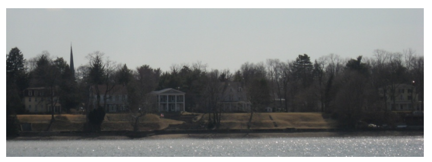
RIVERTON, NJ HISTORIC MANSIONS WERE BUILT FACING THE RIVER RATHER THAN THE STREET. MOST OF THESE STATELY HOMES ARE STILL INHABITED OR HAVE BECOME INNS AND RESTAURANTS TAKING ADVANTAGE OF THE RIVER VIEW.

In recent years, as the pollution in the Delaware has declined. communities are starting to turn back to the River for its beauty, recognizing that life by a clean river is not only desirable but can be economically valuable. Maintaining natural areas, trees, wildlife, and healthy а streamside helps to increase property values by reducing pollution, lessening the threats and impacts of flooding and by increasing property and community aesthetics.