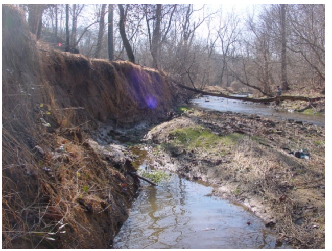
BUCKS COUNTY, PA. BANK EROSION FROM EXCESSIVE RUNOFF IN TINICUM CREEK. THE SEDIMENT FROM THIS BANK RUNS DOWNSTREAM MUDDYING THE WATER, SMOTHERING STREAM BOTTOM HABITAT, AND SUFFOCATING FISH, MUSSELS AND OTHER AQUATIC LIFE.

Homes and businesses located in the floodplain increase polluted runoff because of this proximity to the waterway. The removal of native vegetation and the creation of impervious