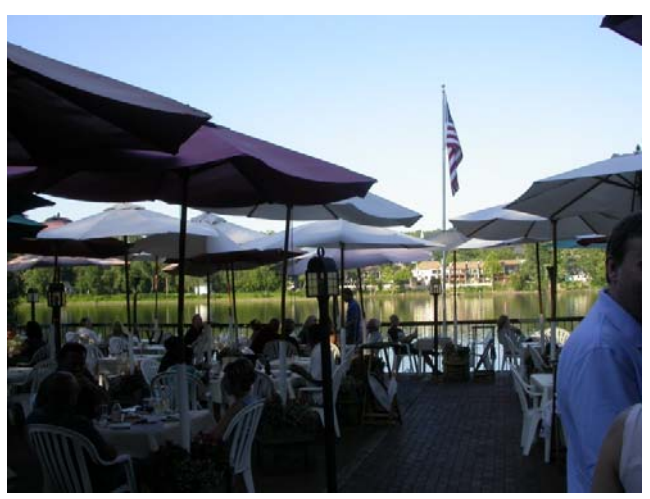
NEW HOPE, PA THE LANDING RESTAURANT FEATURES RIVERSIDE DINING WITH VIEWS OF LAMBERTVILLE, N.J AND THE DELAWARE RIVER.

A clean and healthy Delaware River increases the appeal of commercial properties and businesses that benefit from the River as an attraction. On a nice day, people are drawn to the River; riverfront businesses gain an increase in customers and foot traffic based on their location. Riverfront restaurants, art galleries, inns, Bed and Breakfasts, charter fishing boats, coffee shops, and retail shops all benefit from a proximity to the River and parks when they are clean and attractive.