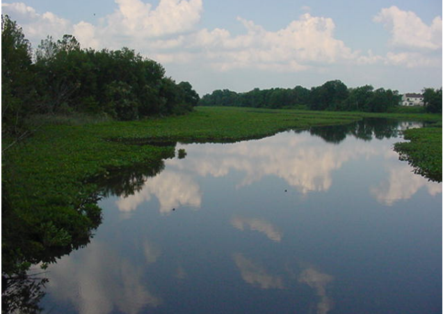
WETLANDS ARE FILTERS AND BUFFERS FOR RISING WATER LEVELS. THIS AREA IS ALONG BEAVER CREEK, A TRIBUTARY OF OLDMANS CREEK, A NEW JERSEY TRIBUTARY OF THE DELAWARE RIVER.

In Ohio, the Department of Transportation found that on average it costs between $3-$10 per linear foot to preserve a stream, while it costs almost $300 per linear foot to restore it.<sup>37</sup> Protecting our floodplains and buffer areas keeps people from building in the floodplain where they are vulnerable to floods and flood damages while at the same time protecting our public and private lands from being literally washed away.