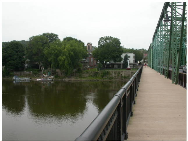
NEW HOPE-LAMBERTVILLE BRIDGE. PEDESTRIANS CAN WALK OVER THE DELAWARE RIVER FOR SHOPPING AND DINING ON EITHER SIDE OF THE RIVER. GOURMET RESTAURANTS, ANTIQUE SHOPS, CRAFT GALLERIES, SALON BOUTIQUES, AND UNIQUE JEWELRY STORES BENEFIT FROM A STEADY FLOW OF CUSTOMERS.

At the riverfront in downtown Philadelphia, Moshulu has transformed a historic four mastered sailing ship from the early 20<sup>th</sup> century into a fine dining restaurant docked at Penn's Landing. The restaurant is one of many fine dining experiences that may be enjoyed along the Delaware River. The Spirit of Philadelphia is a riverboat cruise that combines the beauty of the River, the spirit of the City, and a buffet dinner and a show for around $65 per person. River cruises like this one are not uncommon to the Delaware River.<sup>48</sup> The Liberty Belle docked in the Navy Yard offers a similar experience and can be rented out for weddings or other large events for up to 600 people; people pay more than $6,000 for this Mississippi style riverboat to enjoy their evening on the River.<sup>49</sup>