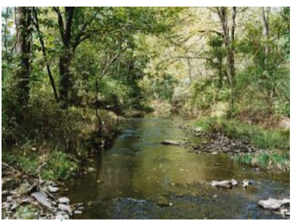
BUFFER. VEGETATED STREAMS PROVIDE POLLUTION FILTERS, FLOOD PROTECTION, AND EROSION PROTECTION TO MAINTAIN STABLE BANKS

Vegetated buffers are the banks and adjacent lands of waterways and wetlands with trees, shrubs, and deep rooted plants that act to prevent erosion and trap sediment, while providing habitat, food, and shade for aquatic life and animals, acting as natural filters for pollutants, absorbing floodwaters and providing distance needed to protect communities from flooding