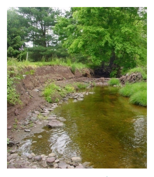
VALLEY CREEK, CHESTER COUNTY, DRN ASSISTED OPEN LAND CONSERVANCY AND RESTORED THIS STREAM REACH WHICH HAD BEEN DEVASTATED BY EROSION.

In the Mill Creek watershed (New Jersey) existing tree cover prevented 6.7 billion cubic feet of stormwater runoff saving the community $350 million in stormwater infrastructure. And in the Frankford-Tacony watershed (Pennsylvania) existing tree cover prevented 38 billion cubic feet of stormwater runoff saving the community $2 billion in stormwater infrastructure. This tremendous savings translates into $176,052,455 per year of benefit/savings for this part of the Delaware River watershed community.<sup>29</sup>