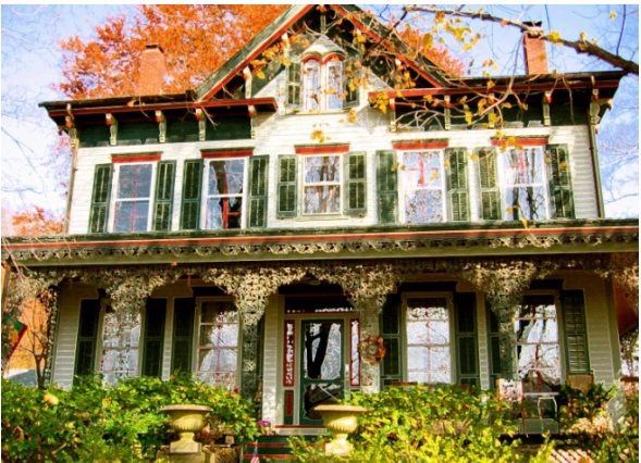
CHESTNUT HILL INN ALONG THE DELAWARE RIVER IN MILFORD, NJ INNS LIKE CHESTNUT HILL ARE APPEALING BECAUSE OF THEIR PROXIMITY TO THE RIVER AND THE BEAUTY AND ACTIVITIES THE RIVER PROVIDE. PHOTO

The Lambertville Station Inn located along the Delaware River in Lambertville, New Jersey offers waterfront lodging, dining, activities, and a ballroom ideal for weddings and receptions.<sup>57</sup> Every room located at the Inn has a scenic waterfront view. The ballroom is made of three glass walls offering river observation from every angle, giving the inside an impression of the outdoors.