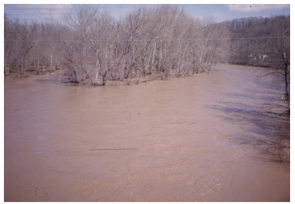
NOT ONLY DOES PROPERTY SUFFER DURING FLOOD EVENTS, BUT THE RIVER SUFFERS AS WELL. ALTHOUGH FLOODS ARE A NATURALLY OCCURRING PROCESS FOR RIVERS, NON NATURAL STRUCTURES, LITTER, AND ANYTHING THAT FLOOD WATERS COME IN CONTACT WITH IS CARRIED INTO THE RIVER, POLLUTING IT.

Other often unrealized expenses include health threats, and the cost of lost food and polluted drinking water. Repair, renovation and demolition operations that must occur in the wake of a flood often generate airborne asbestos mineral fiber that can cause chronic lung diseases or cancer.<sup>19</sup> Inhalation of asbestos can cause lung disease that can be fatal.<sup>20</sup> Lead is another dangerous toxin that can be released during repair, renovation or demolition operations. If inhaled or ingested, lead can cause damage to the nervous system, to the kidneys, to blood forming organs and to the reproductive system.<sup>21</sup>