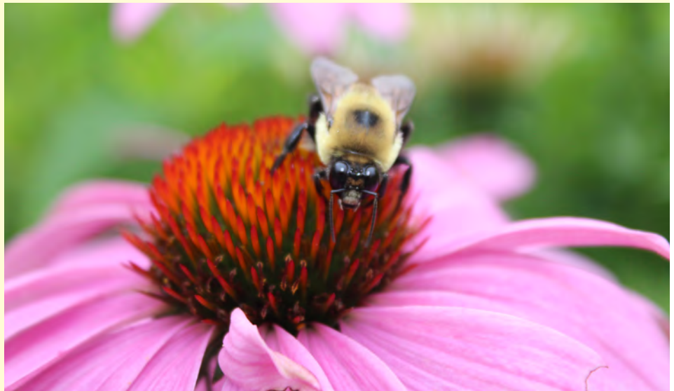
Bumblebee on purple coneflower. F. Zerbe