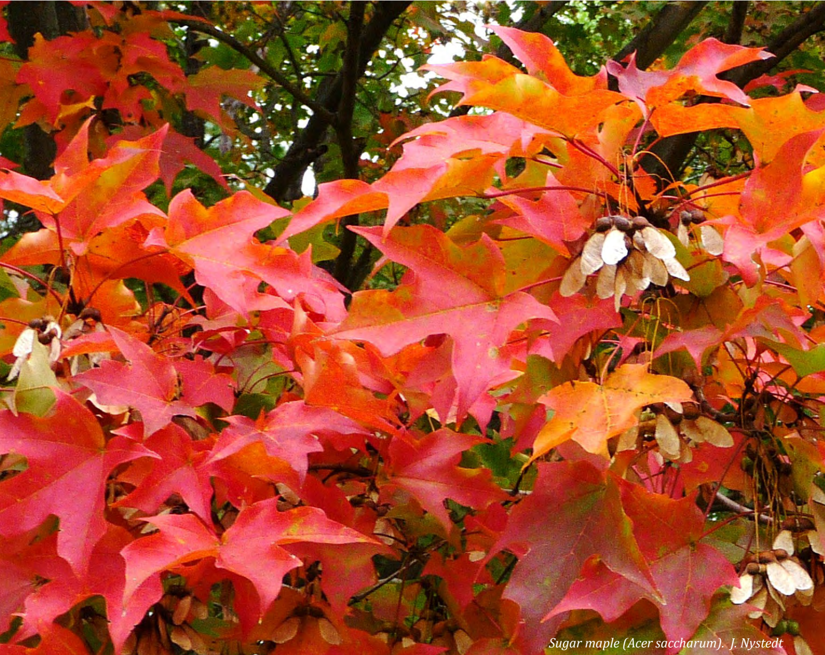
Sugar maple (Acer saccharum). J. Nystedt

Delaware Riverkeeper Network 925 Canal Street, Suite 3701 Bristol, PA 19007 215-369-1188 www.delawareriverkeeper.org