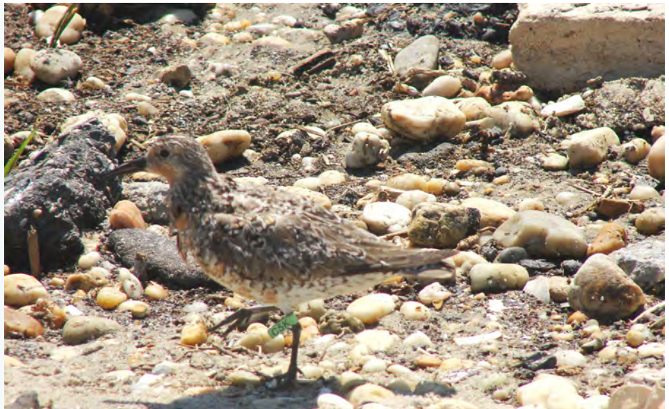
A red knot rufa along the Delaware Bayshore.

Check our website regularly for details on how you can lend your support to the listing of red knots.