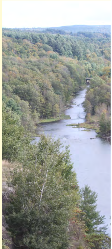
Right: The Neversink River, just below New York City's drinking water reservoir. M. van Rossum